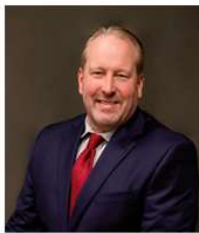
Ken Morrow Texas State Board of Education District 3